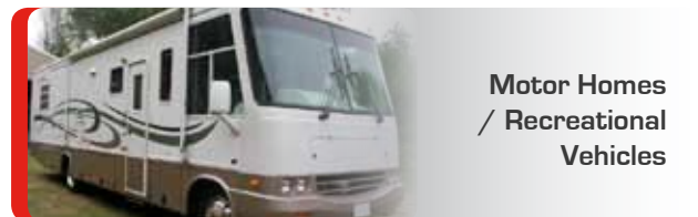
Motor Homes / Recreational Vehicles