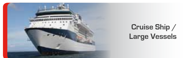
Cruise Ship / Large Vessels